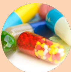
Immediate & Modified Release