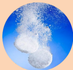
Fast Disintegrating Tablet