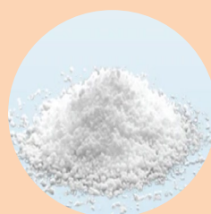
Granules & Powders